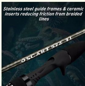
Stainless steel guide frames & ceramic inserts reducing friction from braided lines